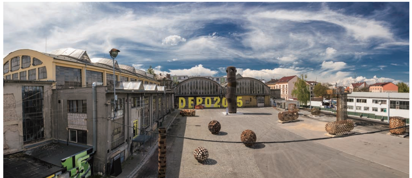
Pilsen 2015.