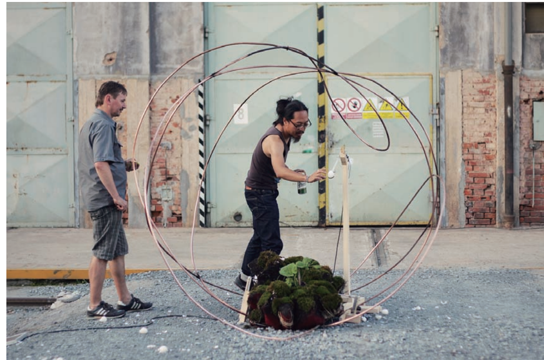
Youkobo Art Space, Tokyo