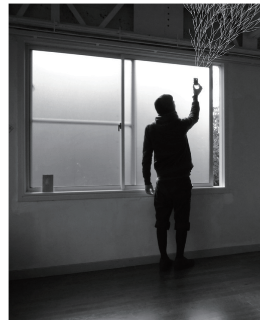
poème électronique pour le monde

2014 Trasy vlasů [second link], Alfréd ve dvoře, Praha 2013 Koupelny I., II. , Alfréd ve dvoře, Praha 2013 Mondšajn , Meetfactory, Praha 2012 Without that , composition for Czech Radio 3 2012 Laputoids , Duchcov 2011 Untitled , BioOko, Praha 2011 Multiplace Opening , Dům umění, Brno 2011 Orestek , Na zábradlí, Praha 2010 Sound installation , National Library of Technology, Praha 2010 Kokkola , F. X. Šalda Theatre, Liberec 2009 LOA 15 Steps , NOD, Praha 2009 Creative destruction , AVU, Praha 2009 Camille , Alfréd ve dvoře, Praha 2007 Mikroloops , Školská 28, Praha