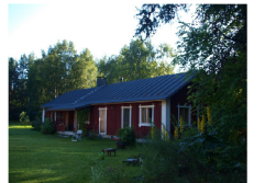
Art Break - II, Finland