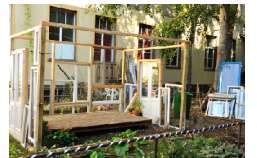
HomeBase - N.Y., Berlin, Tel Aviv