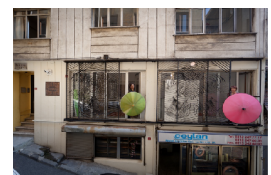
Caravansarai - Istanbul, Turkey