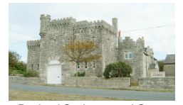
Portland Sculpture and Quarry Trust (PSQT) - Portland, UK

Participating Residencies : Caravansarai (Turkey ) ,Arqueopia (Mexico), HomeBase (US, Germany, Israel ) ,KulttuurKauppila (Finland ) ,Art Break (Finland ) ,Portland Sculpture and Quarry Trust (UK ) ,Big Ci (Australia ) , Nha San Studio (Vietnam ) ,ACOSS (Armenia ) ,INSTINCT (Singapore ) , Mediaelectronque (Greece ) , GeoAir (Georgia ) ,Studio Kura ( Fukuoka ) + others