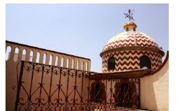
Arquetopia - Puebla/Oaxaca, Mexico