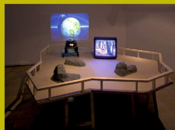
Contact Zone, 2008, Zagreb, Croatia, Almut Rink