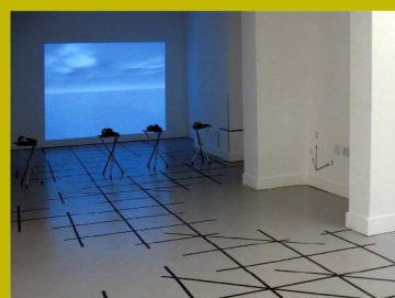
Foamywater, 2008, Austrian Cultural Forum London, Almut Rink