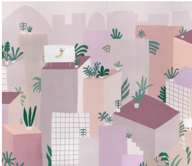
Acrylic gouache on cold-pressed paper, (cropped) original size: 830 x 550mm