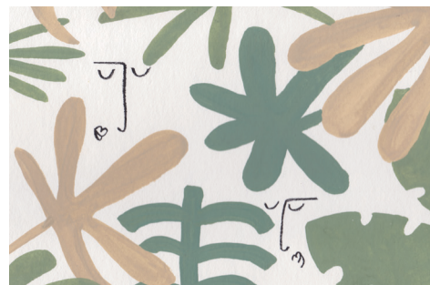
Acrylic gouache on cold-pressed paper (cropped) Original: 400 x 300mm