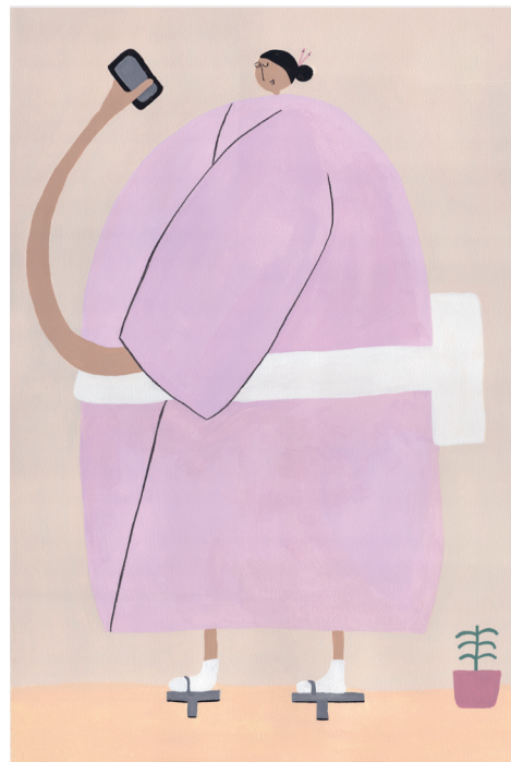
Acrylic gouache on cold pressed paper - original size: 550 x 830mm