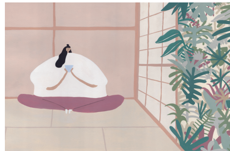
Acrylic gouache on cold-pressed paper -vv original size: 830 x 550mm