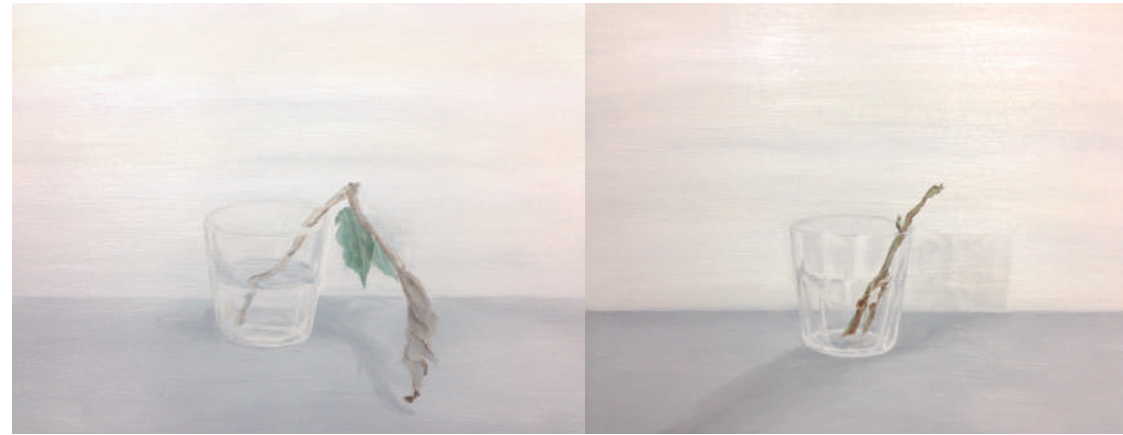
The first day, oil on board, 22 x 27.5cm

些細なことを観察すると、予期しないことを発見することもある。落ち葉には美しさも感じ取れ、それらに現れる葉脈の様子は異なるアウトラインと個性をもち、人間の手のひらの線を思い起こさせる。また、その葉の重ねた年や病気によって起こる変化も見事である。葉脈、色、形といったものが命の象徴である。その命が終わる時、春の新生の到着を待っている我々にとって、些細な記憶として残る。